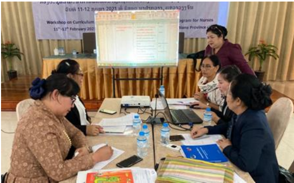
21. Workshop on Curriculum Development of PIPN (February 2021)