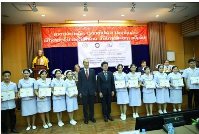
68. Full-Licenses Handover Ceremony (December 2022)