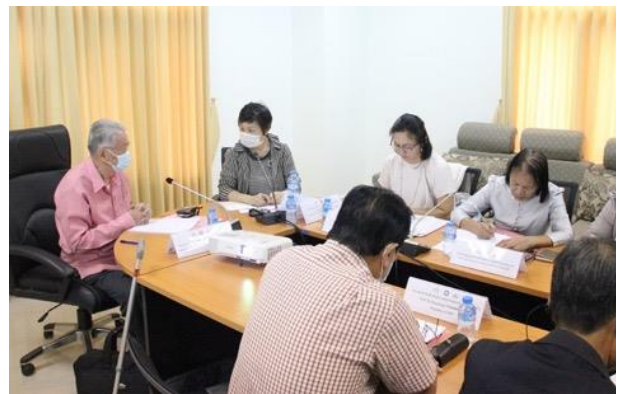
89. Registration and Licensing System for Nurses and Midwives and Disciplinary Function of the Healthcare Professional Council (August 2023)