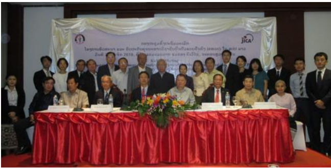
1. Kickoff meeting (November 2018)