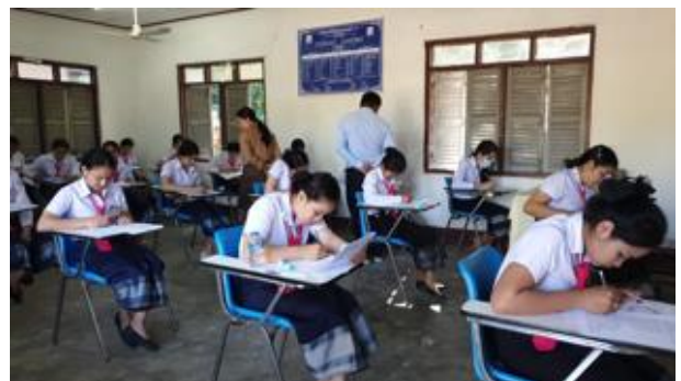
73. The 3rd National Examination in 2022 (February 2023)