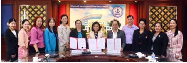
92. Meeting on further collaboration with Thai Nursing and Midwifery Council (September 2023)