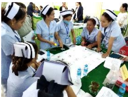
91. 6 th Technical Meeting on sharing experience of PIPN in Southern Provinces and Northern Provinces (September 2023)