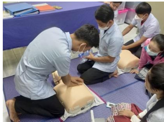
54. Study tour for Provincial committees of PIPN (Northern Provinces) (July 2022)