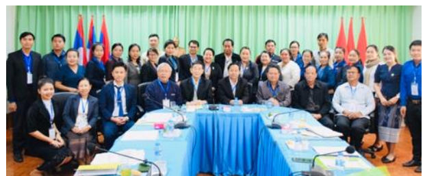
20. The 1 st National Examination for Nurses and Midwives (January 2021)