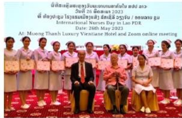
83. Celebration for International Nurses Day and Full License Handover Ceremony (May 2023)