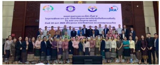
94. 6 th Joint Coordination Committee (JCC) Meeting (October 2023)