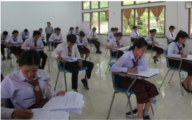
10. Pilot National Examination (September 2019)