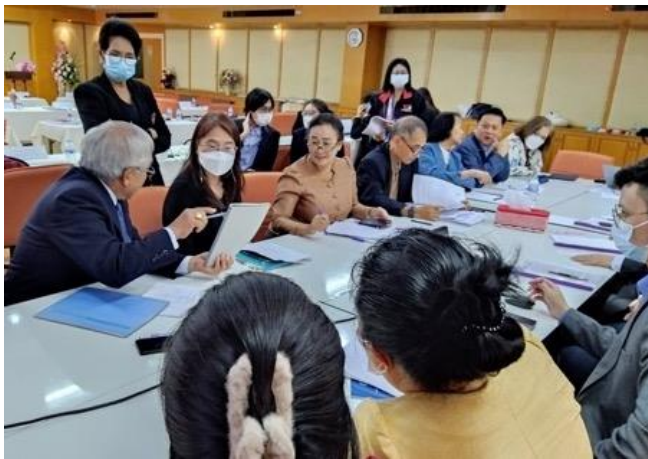
84. Continuing Professional Development (CPD) Forum by the Partnership Project for Global Health and Universal Health Coverage Phase 2 (June 2023)