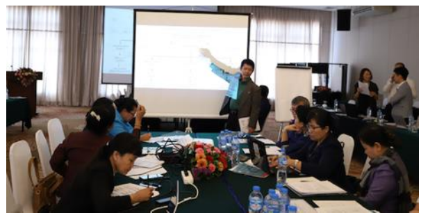
14. 1 st Technical Meeting on Nurse Internship Program (February 2020)