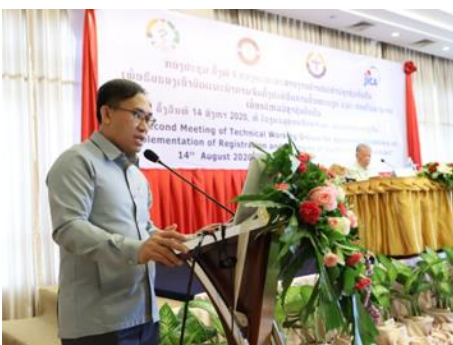
16. Second Meeting of Technical Working Groups for Legislation on Healthcare Professionals (August 2020)