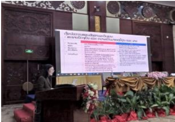
75. Workshop on the Concept of Passing Criteria for National Examination (February 2023)