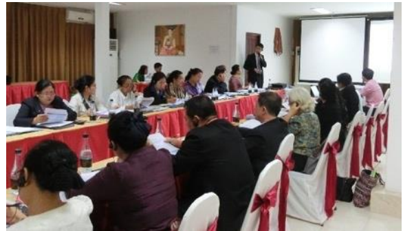
2. Creation of the outline of the National Examination (January 2019)