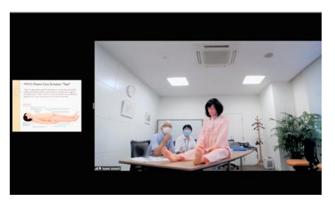
30 TOT for PIPN Clinical Teachers (August 2021)