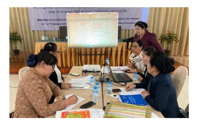
21. Workshop on Curriculum Development of PIPN (February 2021)