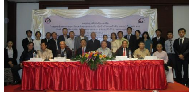
Annex 1-3: Meetings and workshops Photo