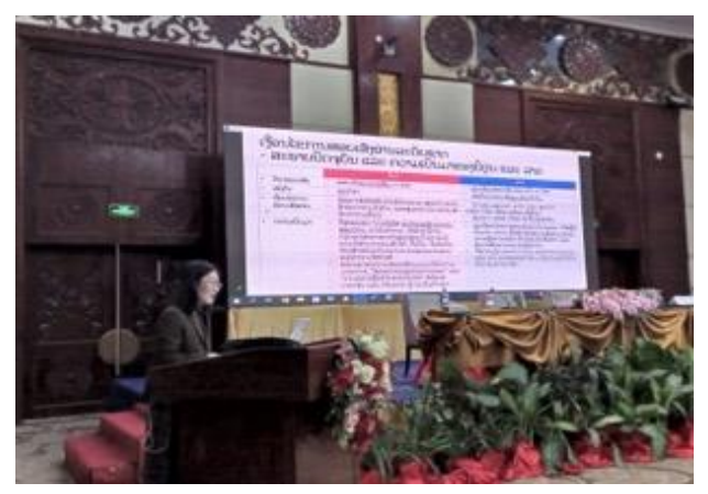
75. Workshop on the Concept of Passing Criteria for National Examination (February 2023)