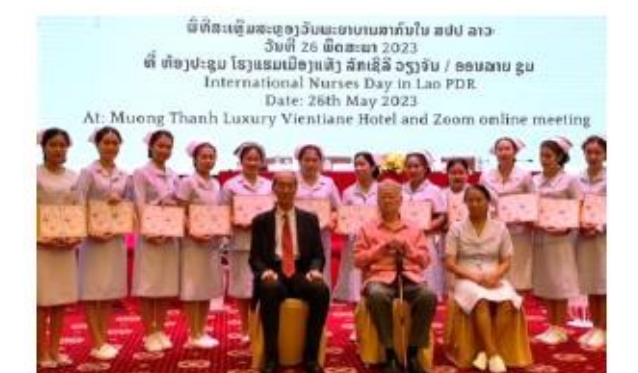
83. Celebration for International Nurses Day and Full License Handover Ceremony (May 2023)