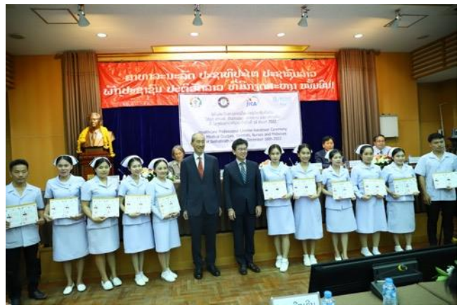
68. Full-Licenses Handover Ceremony (December 2022)